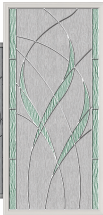
Modified Waterside Design