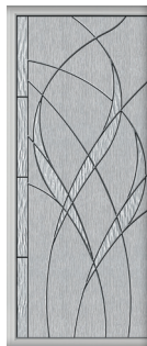
Original Waterside Design

Choose an existing doorglass design and modify the coming, glass colors, or opacity level. Change the size, or add new design features into an existing pattern. Also available in Severe Weather.